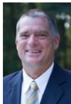
St. Johns County Superintendent of Schools